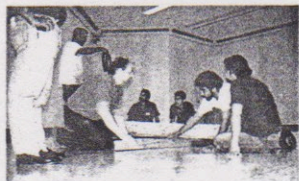
Unloading and installing Cartographies , MAVAO.