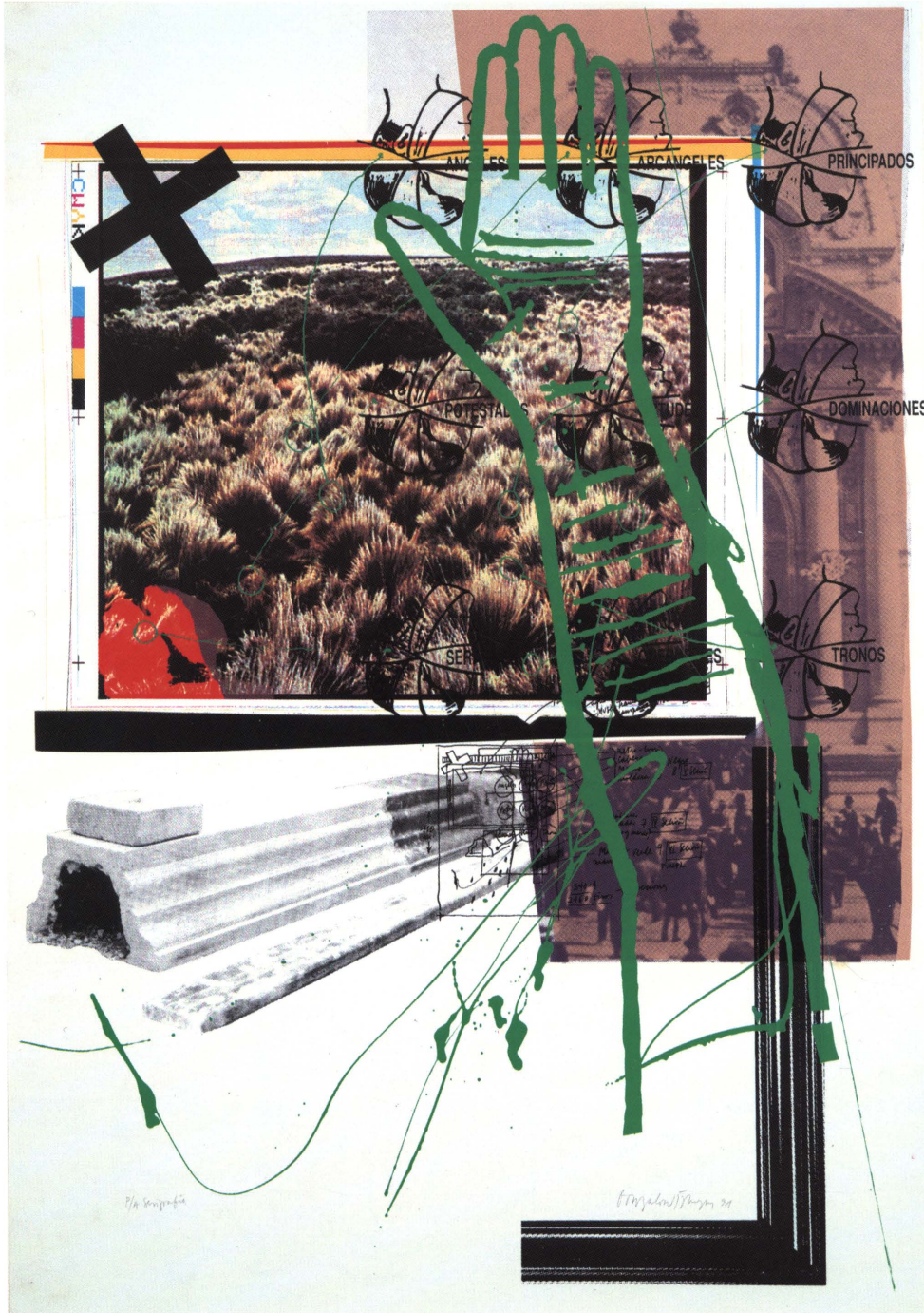
34. Gonzalo Díaz. Untitled. 1991. Screenprint printed in color, comp.: 42 1/8 x 29 15/16" (107 x 76 cm), sheet: 43 5/16 x 30 3/8" (110 x 77.2 cm)