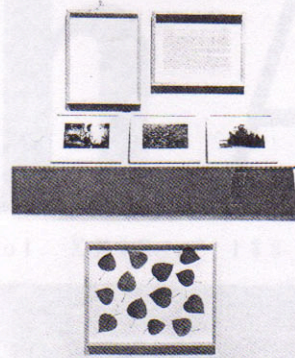
Marlene Creates, Places of Presence: Newfoundland Kin's Ancestral Land, 1989-91 .

much African culture. Her view is not that of the objective anthropologist, but of a (black) artist using narrative to arrive at that place that is at once cultural, geographical, political and personal.