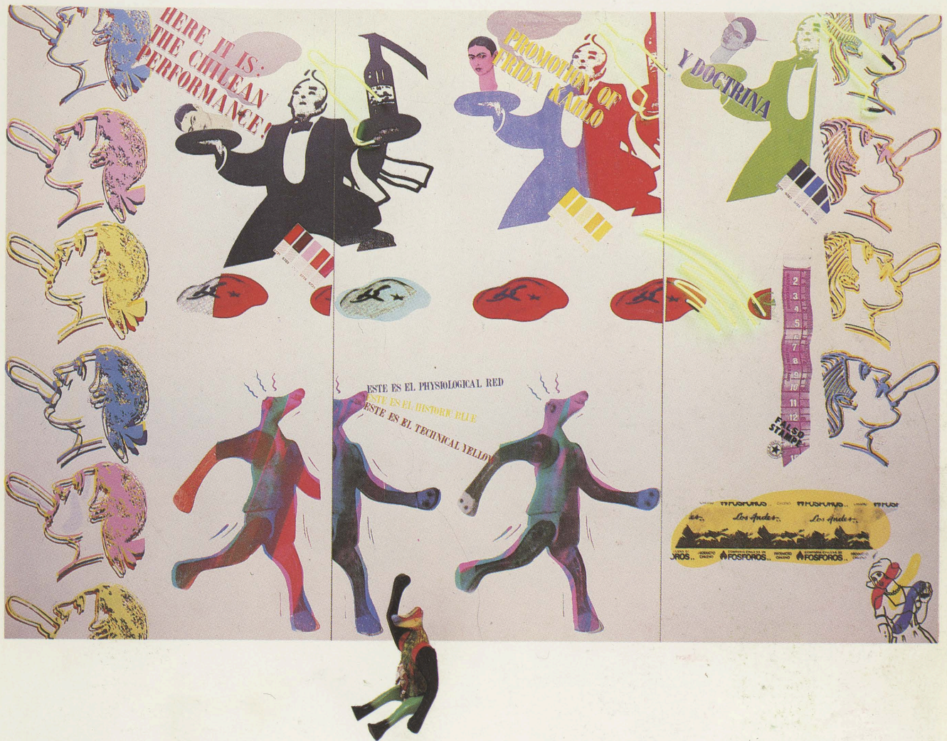
LET'S SEE IF YOU CAN RUN AS FAST AS ME, 1983, photo serigraphy and stencil on polytoile with green neon and object, 270 x 400